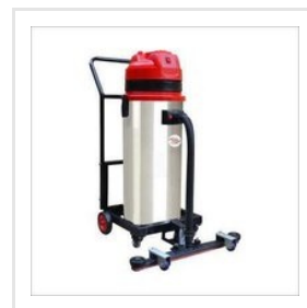
Commercial Vacuum Cleaner