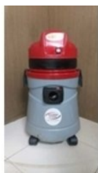
PORTABLE VACUUM CLEANER

1.5 HP Single Disc Scrubbers, 130 Bar High Pressure Jet Washer, 150 Bar High Pressure Jet Washer, 25 L Wringer Bucket, 2HP Single Disc Scrubber, 2HP Single Disc Scrubber Machine, 34 L Wringer Bucket, 40 L Scrubber Drier, ALFA SWEEPERS, Back Pack Vacuum Cleaner, Battery Operated Ride-on Floor Scrubber Dryer, Battery Operated Scrubber Dryers, Carpet Renewing Machine, Commercial Vacuum Cleaner, Disc Hard Brushes, etc.