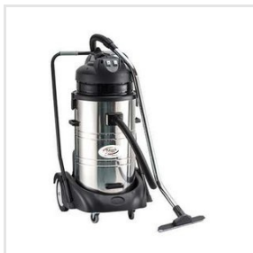
Industrial Vacuum Cleaner