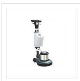
2HP Single Disc Scrubber Machine