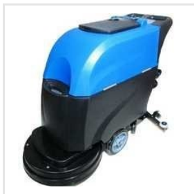
40 L Scrubber Drier