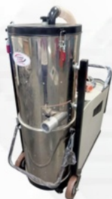
INDUSTRIAL VACUUM CLEANER 100 LTR