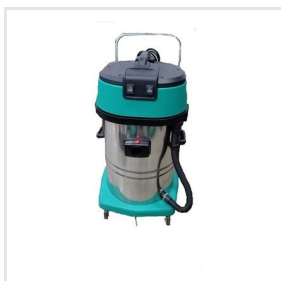
Industrial Vacuum Cleaner Vac-60