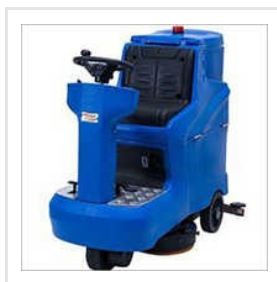
Ride On Scrubber Dryer