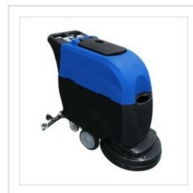
Battery Operated Scrubber Dryers