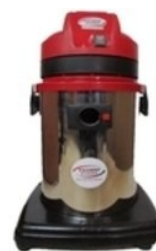
HOUSEHOLD VACUUM CLEANER