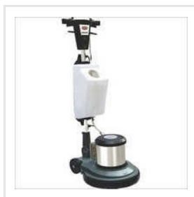
2HP Single Disc Scrubber