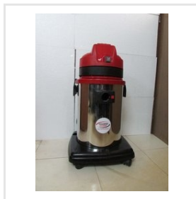
Wet & Dry Vacuum Cleaner