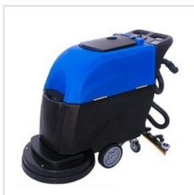
Ride On Battery Scrubber Dryer