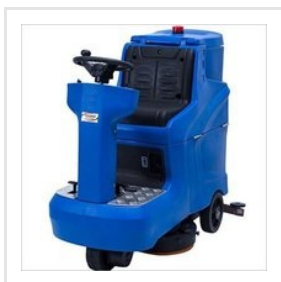
Battery Operated Ride-On Floor Scrubber