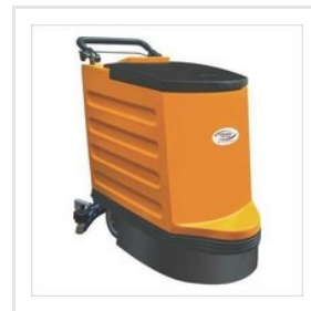
Scrubber Dryer- ASD-25