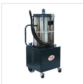
Industrial Steel Vacuum Cleaner