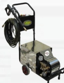
HIGH PRESSURE JET