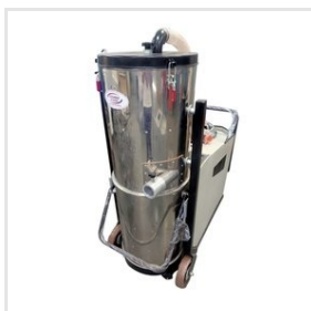
Industrial Vacuum Cleaner 100 Ltr