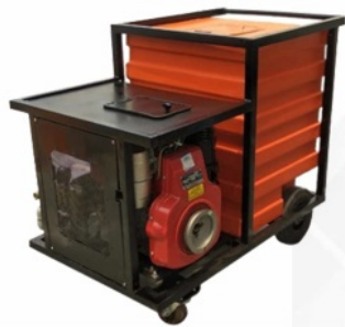
HIGH PRESSURE JET -ENGINE