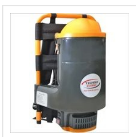
Back Pack Vacuum Cleaner